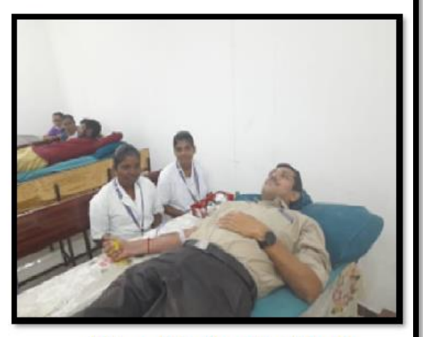
Figure 9.2: Donating blood