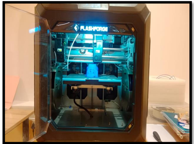
Forge Innovate TN Lab