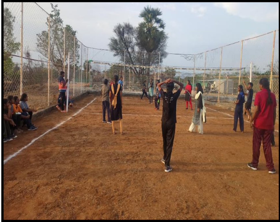
Women's Volleyball Competition