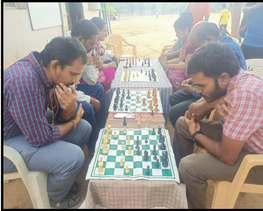
Men's Chess Competition