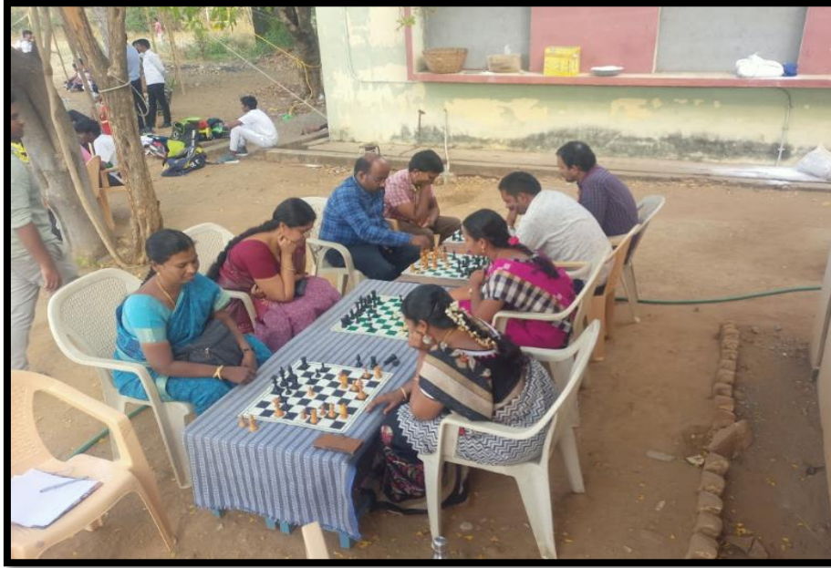
Women's Chess Competition