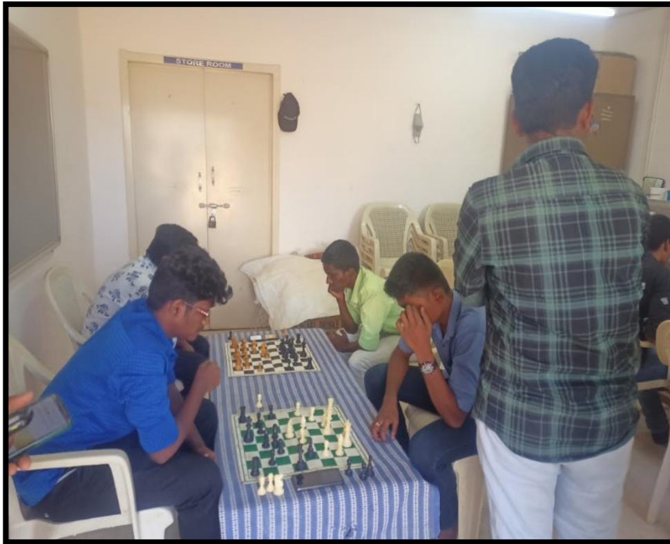
Men's Chess Competition