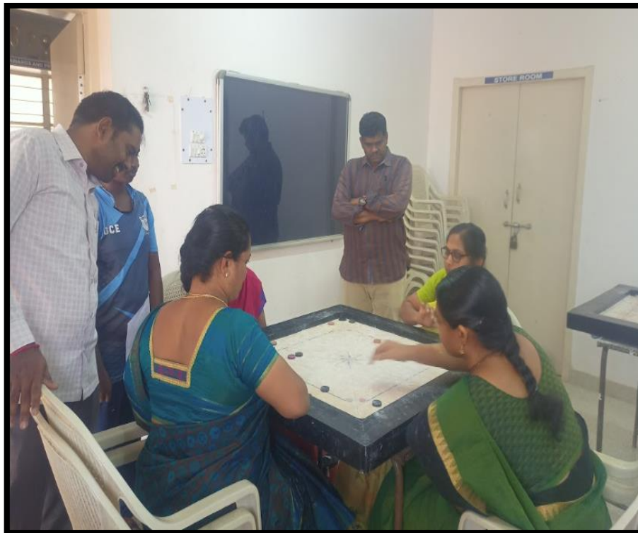
Women's Carrom Competition