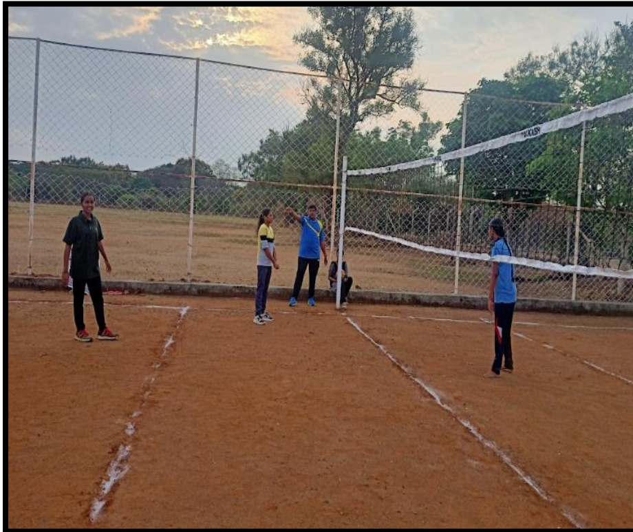
Women's Volleyball Competition