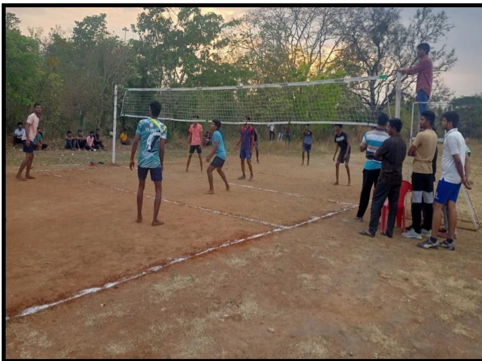
Men's Volleyball Competition