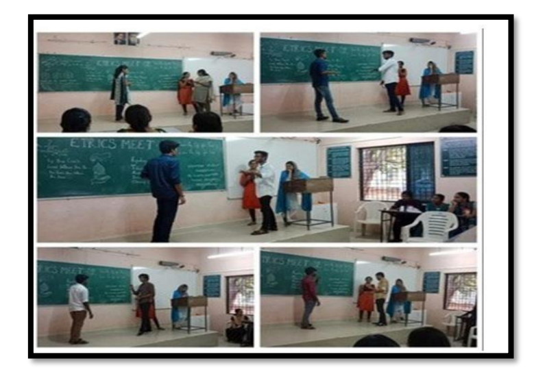
Students participation in Etrics weekly meets