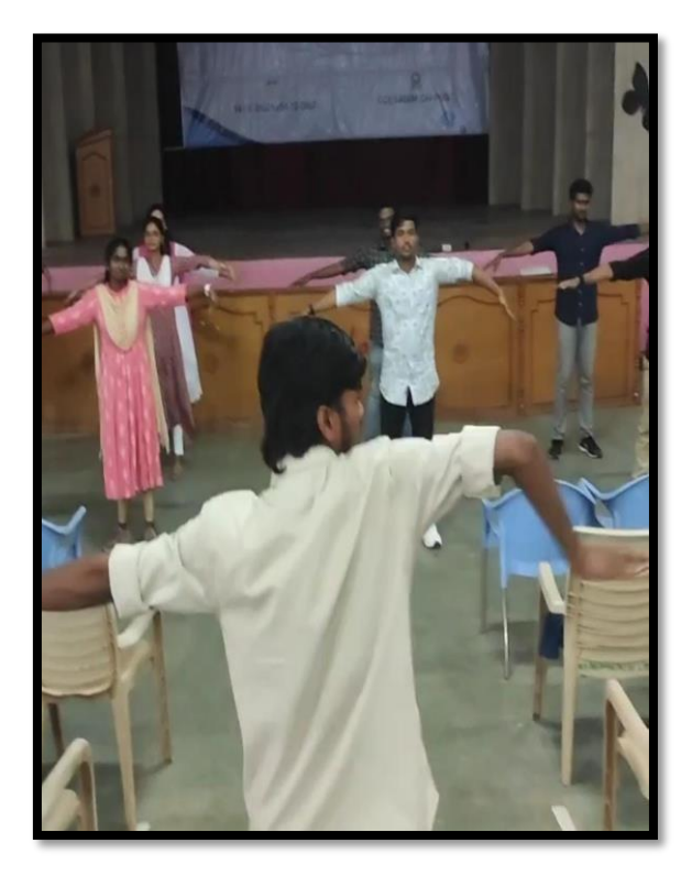
Students participation in group dance to showcase their skills