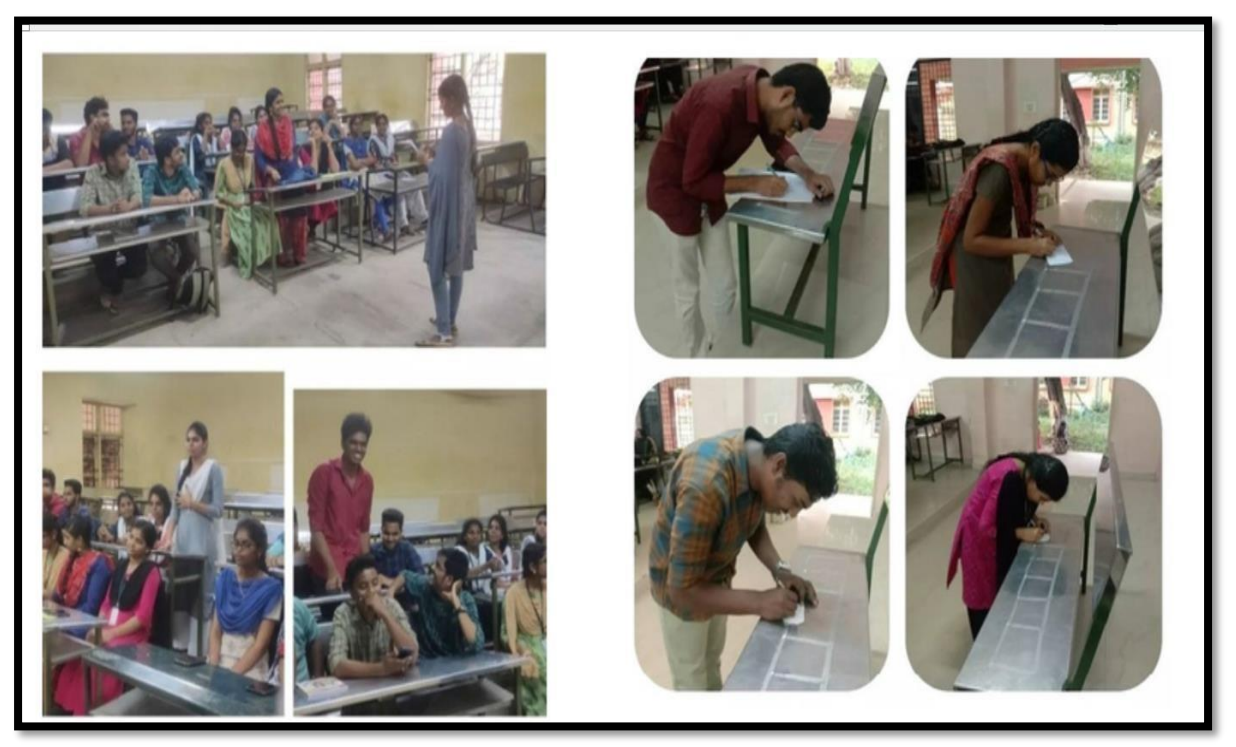
Students participation in Etrics weekly meets

In the year 2022-2023, our first weekly meeting started on 20/10/22. Etrics weekly meets were conducted on every Thursdays at 4.30 to 5.50pm. In every club meet, our goal is to improve the confidence level of the students and encourage them to participate in the events conducted for them. These Projects Activity events consist of info sharing, communication games, solo games, duo games and group activities. This kind of activity will enhance their self-confidence and their ability to work with a team. Prices will be distributed for the winners and the active participants which will encourage the other members to participate eagerly.