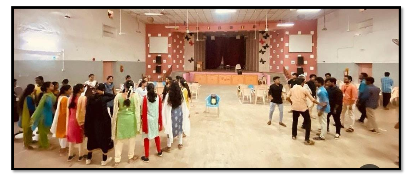
Students participation events in teleportation and dance of life