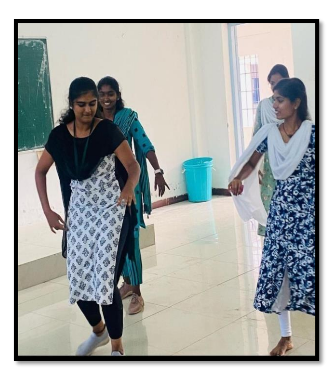
Students participation in free practice sessions