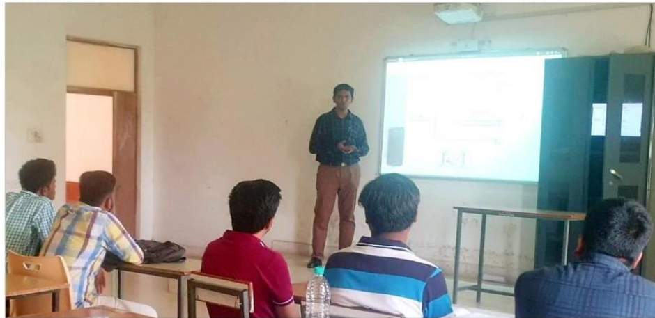
Three Faculty members from GEC, Raipur attended National level FDP on “Electrical Energy Audit” at EEE Department GCE, Salem on 24.09.2019 and 25.09.2019