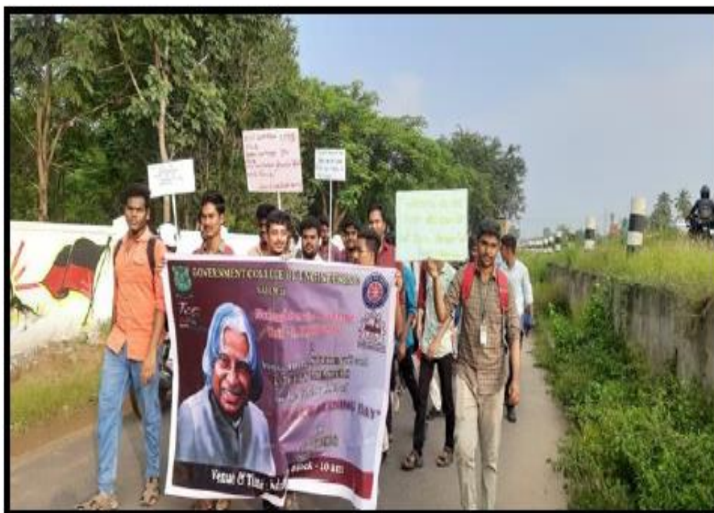
Figure 3.1: Student Volunteers with Poster