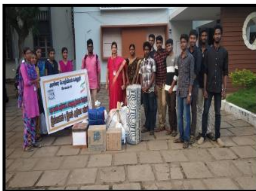
Figure 1.1: Collected funds and things from staffs and our students to affected people during Gaja cyclone

One of our college students is from the remote area of Mannarkudi in Thiruvarur district, those places are one of the most affected places during Gaja cyclone and didn't receive any kind of helps at those time. We decided to distribute the collected things in that place. Our Leo club students directly carry all those things to Mannarkudi and distribute those at that place.