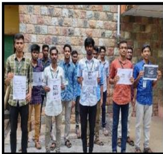
Figure 6.1: Students propaganda against Tobacco Consumption at SIDCO Industrial park

Through this initiative, the NCC Airwing of Government College of Engineering Salem not only commemorated Anti-Tobacco Day but also ignited a sustained conversation and collective action toward building a healthier, tobacco-free community, showcasing the potential of youth-driven initiatives in combating societal health challenges.