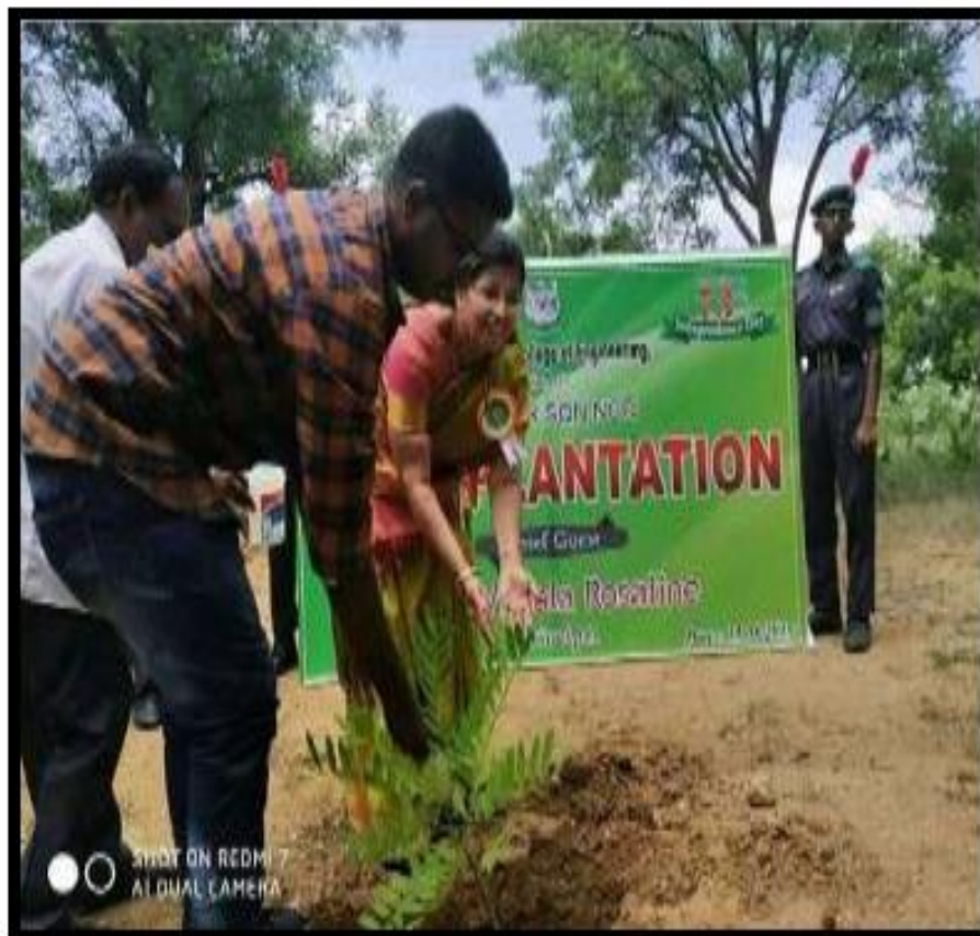
Figure 6.1: Tree Plantation at Saminayakanpatti

The amalgamation of patriotic fervor, disciplined performances by the NCC cadets, and the poignant tree plantation event encapsulated the essence of the occasion, fostering a sense of pride, responsibility, and commitment among the attendees towards the nation's growth and environmental stewardship. Neem tree, banyan tree, Teek Plants are planted at Saminayakanpatti, Salem.