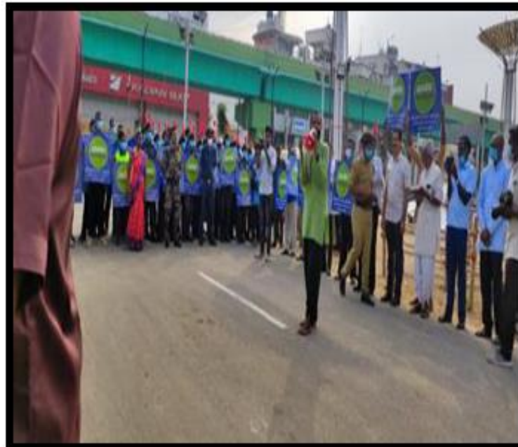
Figure 5.2: Rally for Save Soil Rally Awareness