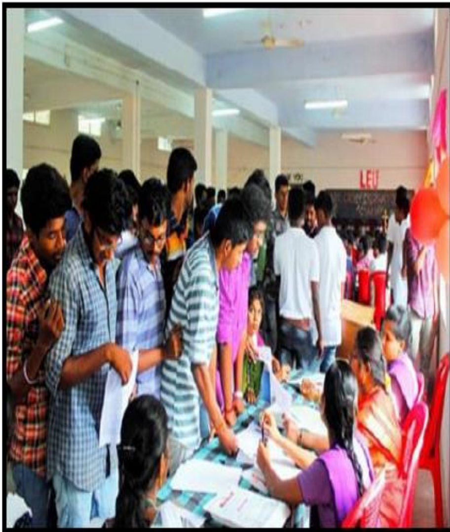
Figure 3.1: Students registering in blood camp

Collaborative agency : Leo-Etrics Club, GCE, Salem and Government Hospital, Omalur.