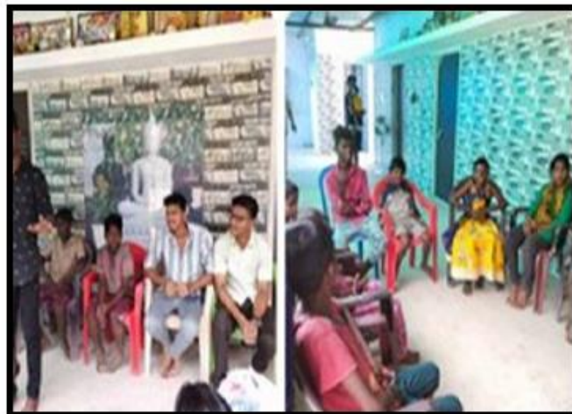
Figure 11.2: Interaction with home children