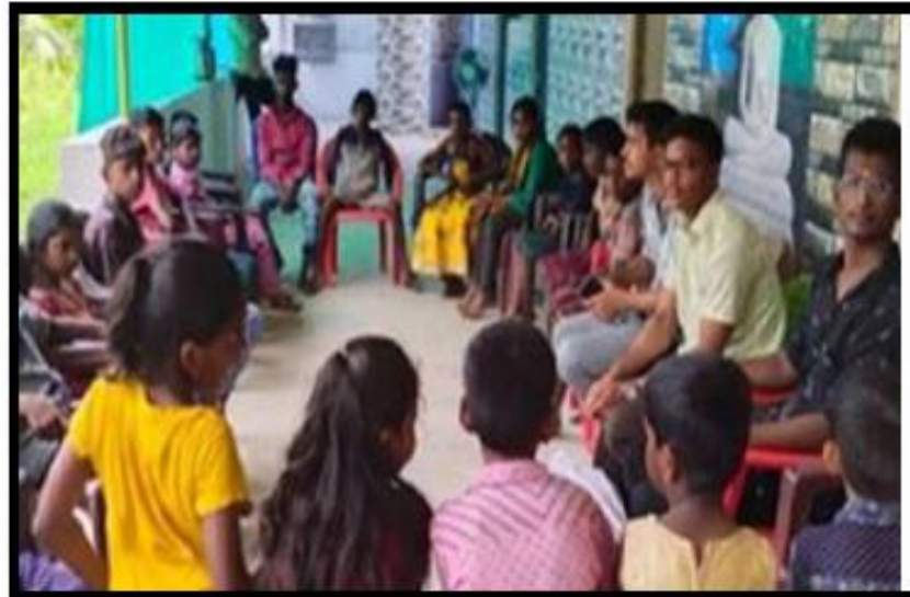
Figure 11.1: Interaction with home children