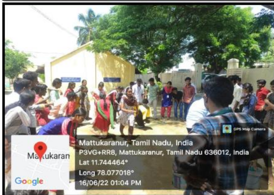
Figure 13.1: Student volunteers with school children