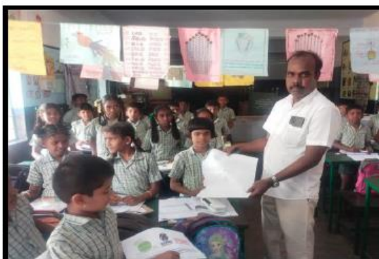
Figure 1.1: Plastic free cloth bags given to school children