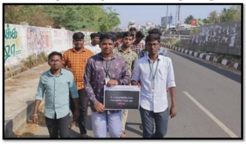
Figure 4.2 Untouchability awareness pledge and rally

Figure 4.1: Department of Civil Engineering